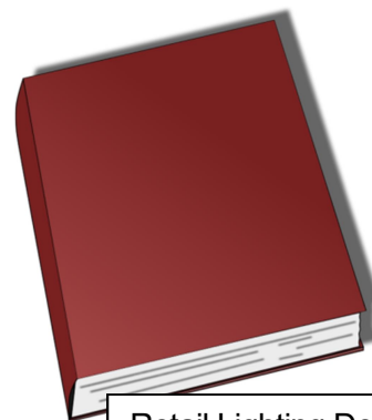
Retail Lighting Design Standard