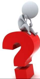
How-to Design Techniques