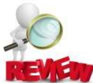
Retail Lighting Design Evaluation